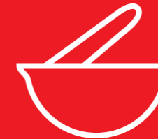
x1 Mortar & Pestle