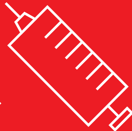
x1 Large Syringe