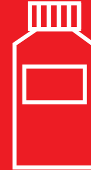
x6 Storage Bottles