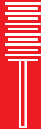
x1 Test Tube Brush