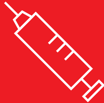
x1 Small Syringe