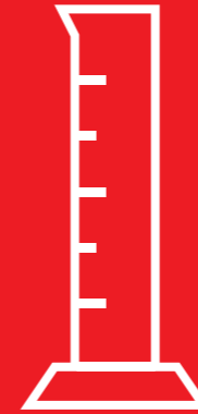
x1 Measuring Cylinder