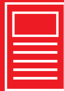
x1 Set of Instructions