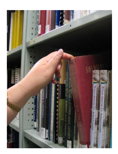
Never remove a book by the top of the spine as this can cause significant spine damage.