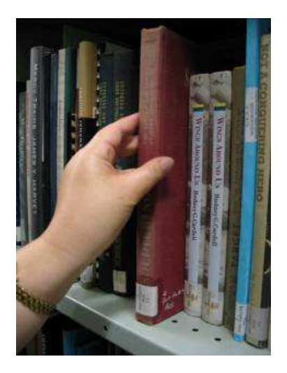
Always push the books on either side back and pull out volume from the middle of the spine.